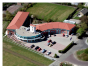
Fletcher Duinhotel Burgh Haamstede **** (Burgh Haamstede)

The hotels or B&Bs on this trip have been carefully selected for their location, atmosphere and/or unique services. All rooms are en-suite. A list of the hotels we work with appears below. If a certain accommodation is unable to confirm due to lack of availability, we will request a comparable alternative. When selecting the accommodation, we try to take into account as much as possible a safe and closed bicycle shed. However, we cannot do this with all of them guarantee and this partly depends on the number of bicycles of other guests.