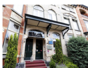
Hotel Fidder *** (Zwolle)