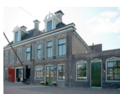
Hotel It Heechhus *** (Lemmer) www.hotellemmer.nl