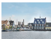
Fletcher Hotel Nautisch Kwartier **** (Huizen) www.hotelnautischkwartier.nl