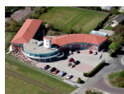
Fletcher Duinhotel Burgh Haamstede **** (Burgh Haamstede)

When selecting the accommodation, we try to take into account as much as possible a safe and closed bicycle shed. However, we cannot do this with all of them guarantee and this partly depends on the number of bicycles of other guests.